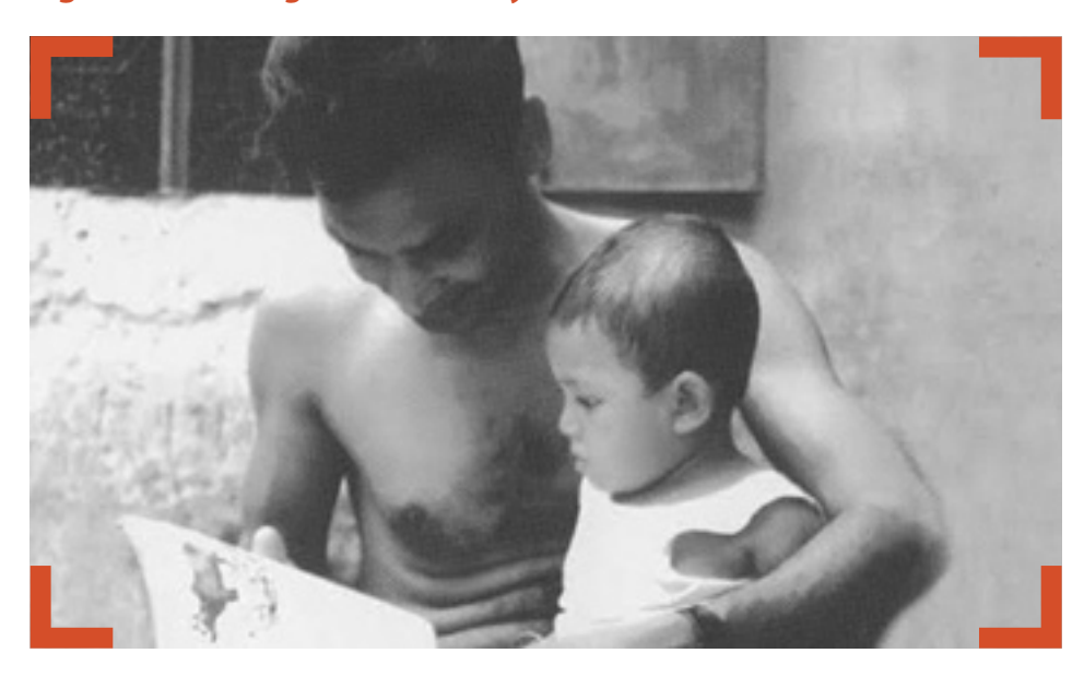
Figure 2: It All Begins with Family