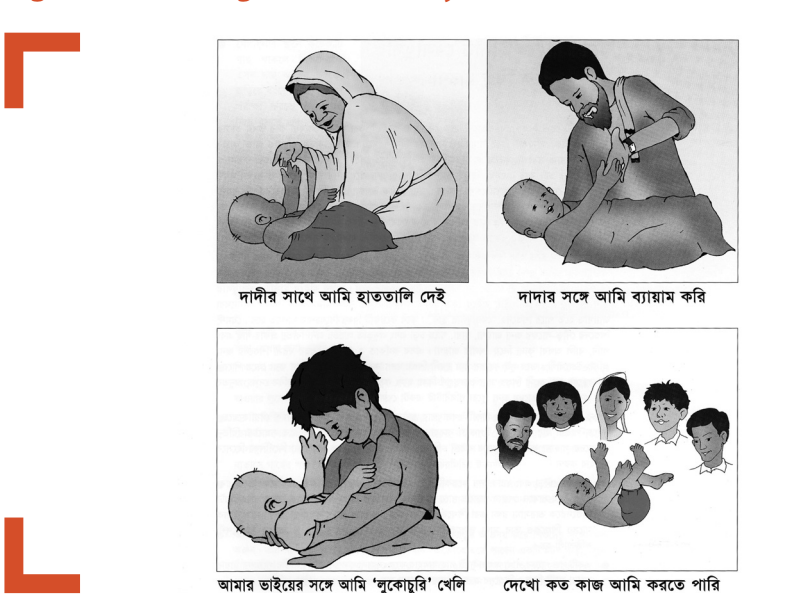
Figure 3: It All Begins with Family

Eleven organisations highlighted the importance of parents and family members engaging in interaction, stimulation and play with their children. Caregivers were encouraged to actively take part in a child's life and to expose them to stimulating experiences and environments within and beyond the household. It should be noted that the materials contained little information about how and why this stimulation is important and did not connect stimulation to the key domains of brain and emotional development.