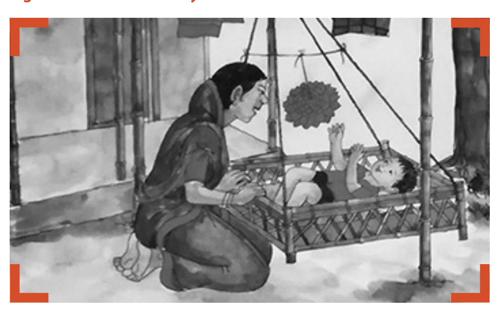
Figure 6: The Power of Play

Fourteen of the organisations analysed identified play as a very important component or thread for early childhood development.