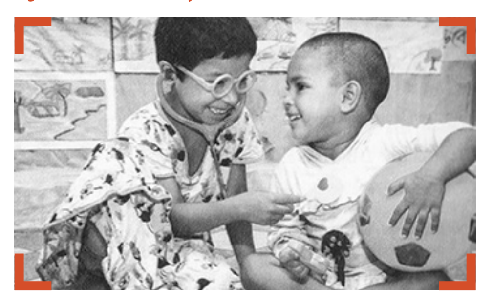
Figure 7: The Power of Play

More and more, play is understood as an integral part of a child's development. Play and active learning provide children with opportunities to explore concepts and learn a variety of skills in a context that extends thinking and builds confidence.