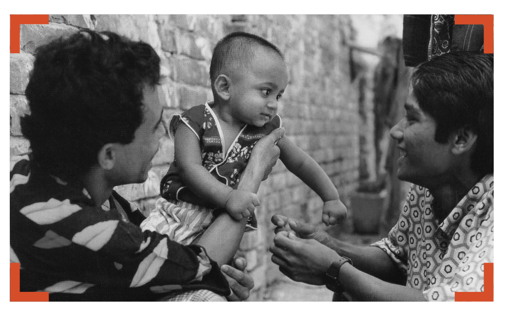
Figure 9: Social Development

Attend different social events with your child which will support children to cope with different environments.