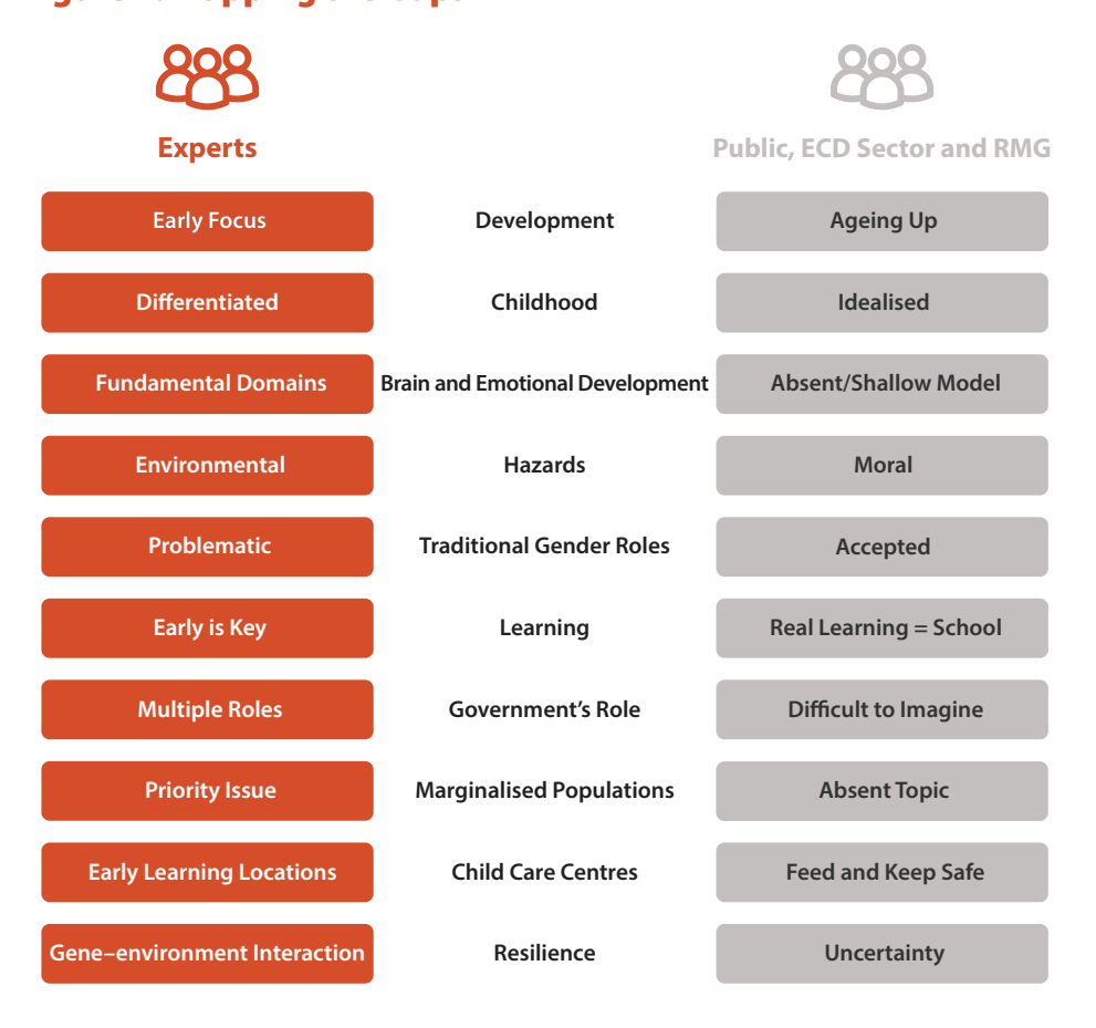
Figure 2: Mapping the Gaps